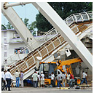
Commonwealth Games: A Look at the Problems