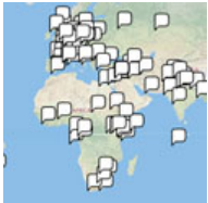
A Global Index of Postcards