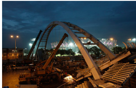
ENLARGE PHOTO+ Cranes work at the site of a footbridge that collapsed outside the Jawaharlal Nehru stadium in New Delhi on Sept. 21, 2010